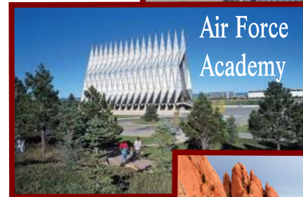
Air Force Academy