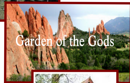
Garden of the Gods